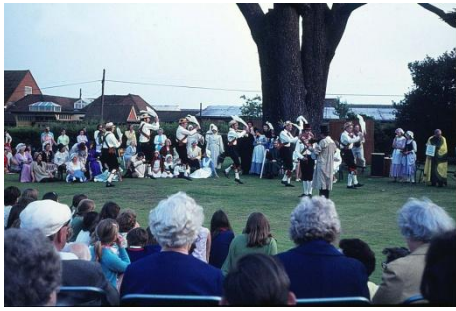
Shinfield Village Fete - 1971

Sometimes it seems we're one of Shinfield's best kept secrets as we've yet to recruit a single person from the village, despite our best efforts. We used to dance at the Shinfield Village Fete, as can be seen in this photo from 1971, but they moved the date some year's back to the traditional Saturday of our End of Season Tour. You can't have an end of season tour before the end! They've now moved the date to the end of June – but COVID put a stop to that. One day! At least we keep the village pub afloat – on a Monday night at least.