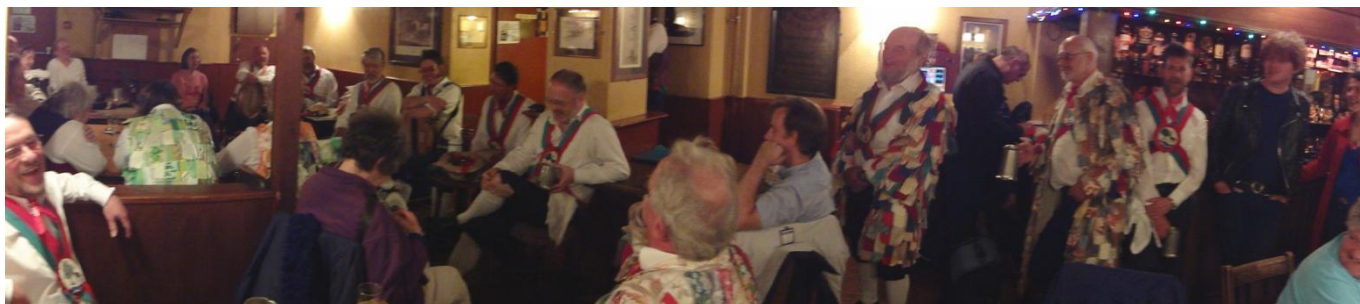
An Eldon Arms session

The evening usually concludes with one of the better après-morris session of the season in the Retreat.